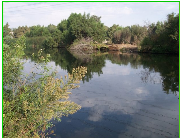
San Gabriel River, Los Angeles County

T HE CALIFORNIA ENVIRONMENTAL DATA EXCHANGE NETWORK (CEDEN) provides a central location to find and share information about California's water bodies, including streams, lakes, rivers, and the coastal ocean. Many groups in California monitor water quality, aquatic habitat, and wildlife health to ensure good stewardship of our ecological resources. CEDEN aggregates these data and makes them accessible to environmental managers and the public.